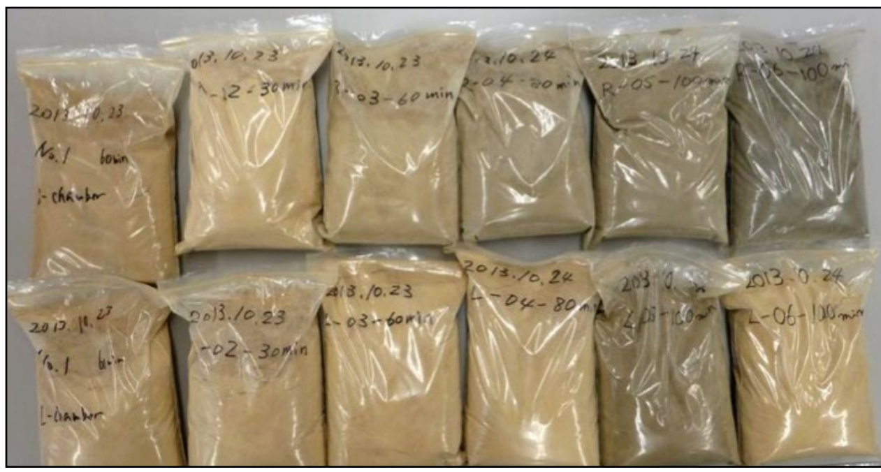
Figure SA-3. Milled wood powders of FS-10 chips, under various milling time, 30, 60, 80, and 100 minutes. Varying color of milled wood samples corresponds to milling temperatures. All materials were directly hydrolysable after milling with no chemical treatment.