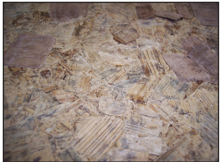
Unpressed (left) and hot-pressed (right) pretreated lodgepole pine samples. Images taken at USDA Forest Products Laboratory.