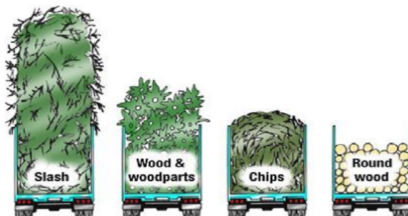
Figure 3. Volume Differences of the same Weight Material by Different Product Types ( http://www.extension.org/pages/70315/biomass-transportation-and-delivery#.VTq5mWRVikp )

Now that students have calculated their slash piles wood volume they should have a solid understanding of the challenges associated with transporting woody biomass for energy and bio-based products. Students should have discovered by completing steps two and three that the woody biomass they have measured and worked with is in its raw form of slash and small un-delimbed trees, which provides a low bulk density.