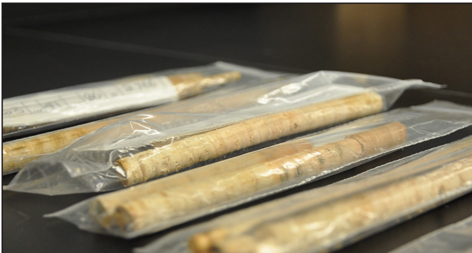
Douglas-fir core samples